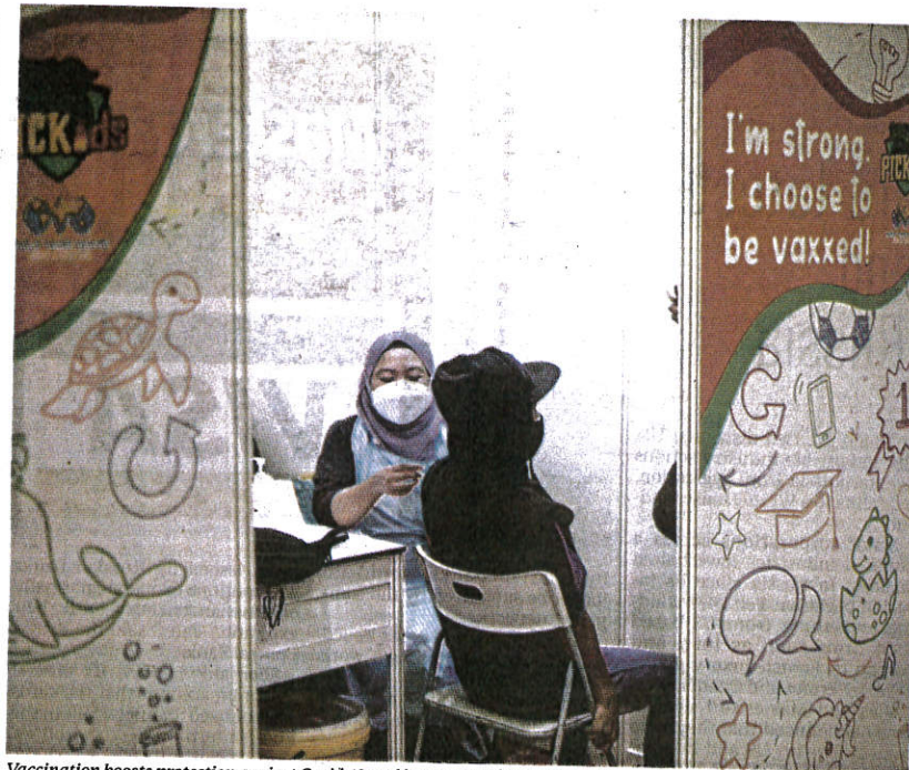
Vaccination boosts protection against Covid-19 and lowers the risk of serious disease.

children who have MIS-C vary depending on which body parts are affected.