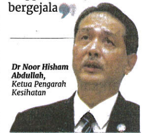
Dr Noor Hisham Abdullah, Ketua Pengarah Kesihatan

● Ketepatan ujian RTK-Ag dan RT-PCR bergantung kepada tempoh jangkitan ketika sampel diambil. Penggunaan RTK-Ag disarankan kepada individu bergejala atau berada dalam kumpulan berisiko tinggi sekiranya tidak bergejala