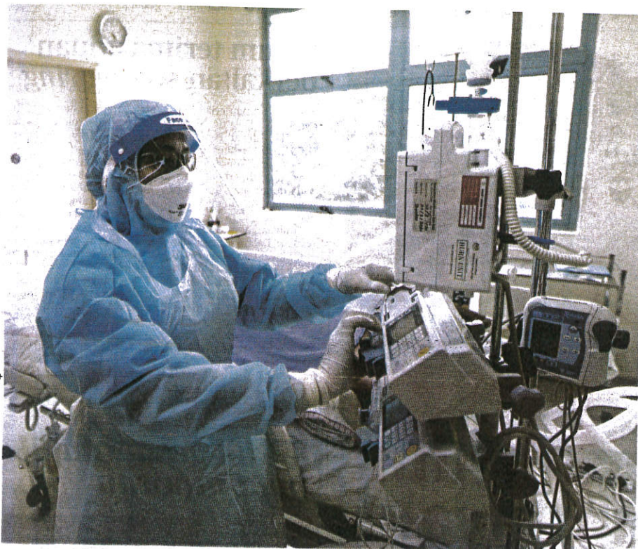
PENGISIAN katil kes kritikal di ICU catat peratusan melebihi 50 peratus di tujuh negeri.

AKHBAR : HARIAN METRO MUKA SURAT : 6 RUANGAN : COVID-19