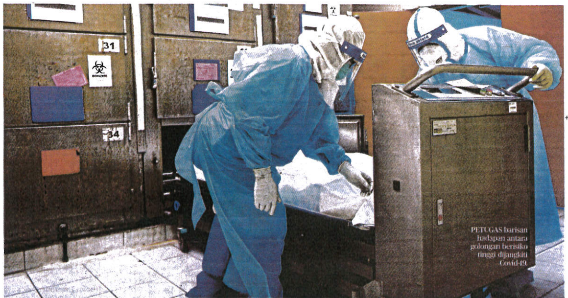
PETUGAS barisan hadapan antara golongan berisiko tinggi dijangkiti Covid-19.

Katanya, pematuhan prosedur operasi standard (SOP) juga perlu berterusan dalam usaha mengurangkan kadar jangkitan, sekali gus menangani virus Covid-19 daripada terus merebak.