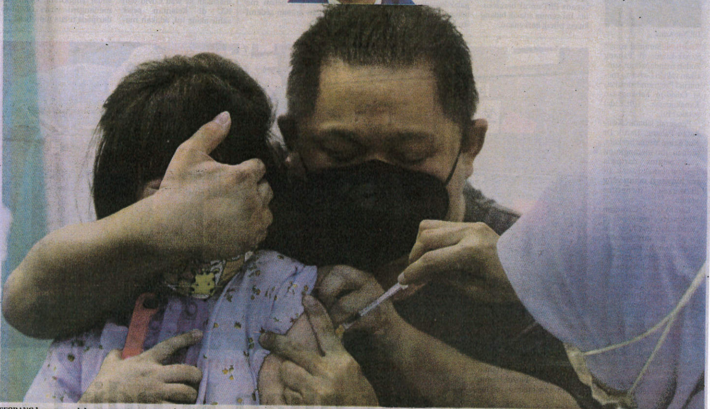
SEORANG bapa memeluk serta menutup mata anaknya ketika petugas perubatan memberikan suntikan vaksin Covid-19 dos pertama di Pusat Pemberian Vaksin (PPV) Offsite Tapak Ekspo Seberang Jaya, kelmarin.

Putrajaya: Individu yang sudah dijangkiti Covid-19 serta selesai menjalani kuarantin tidak perlu membuat ujian ulangan bagi memastikan tiada lagi virus berkenaan di dalam badan.