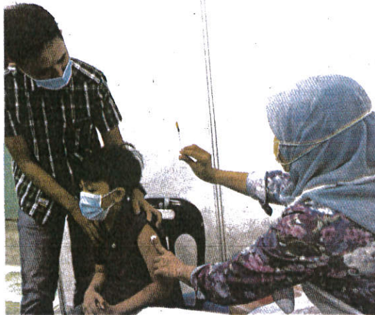
Petugas perubatan memberi suntikan vaksin COVID-19 dos pertama kepada kanak-kanak sempena PICKKids di PPV Offsite Tapak Ekspo Seberang Jaya.

"Risiko kepada kanak-kanak ini sangat tinggi jika mereka tidak divaksin. Ibu bapa sepatutnya lebih takut dan bimbang jika anak tidak diberi vaksin, terutamanya ketika peningkatan kes serta penularan varian Omicron yang mudah merebak ini," ka-